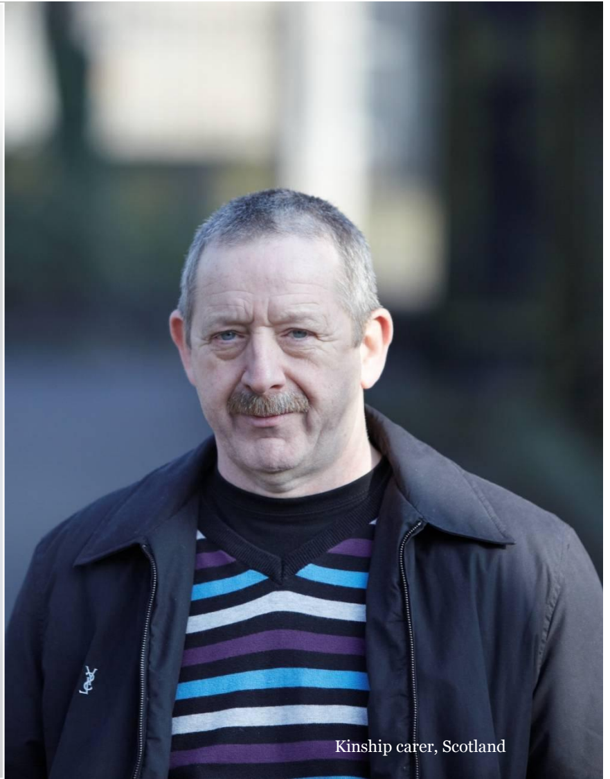
Kinship carer, Scotland

The EU Kinship Carers Project has been working with carers and professionals in 7 European countries with the aim of improving the chances of children in kinship care arrangements to be able to avoid the problems caused by drugs and alcohol.